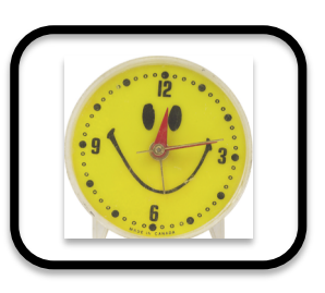
...were very, very habby.

2 Work with a partner. Talk about the experience.